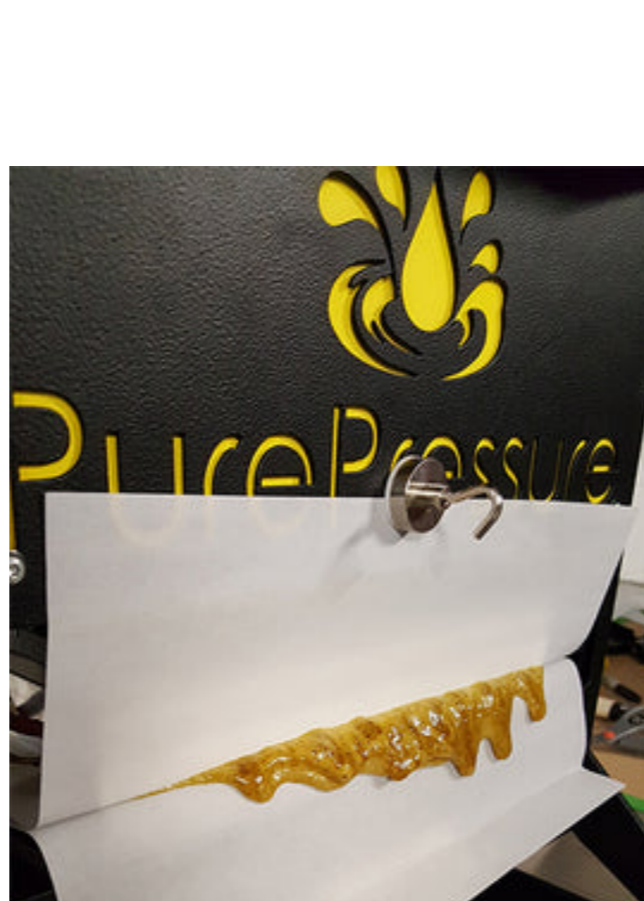
PurePressure Pikes Peak Rosin Press

There are rosin presses that are available for just about any budget. Whether you are looking for an automated commercial rosin press capable of high volumes of 230 grams or more, or a smaller rosin press that is transported and hand-operated, there has never been a better time to shop rosin presses. Check out the full line of some of the best rosin presses on the market today.