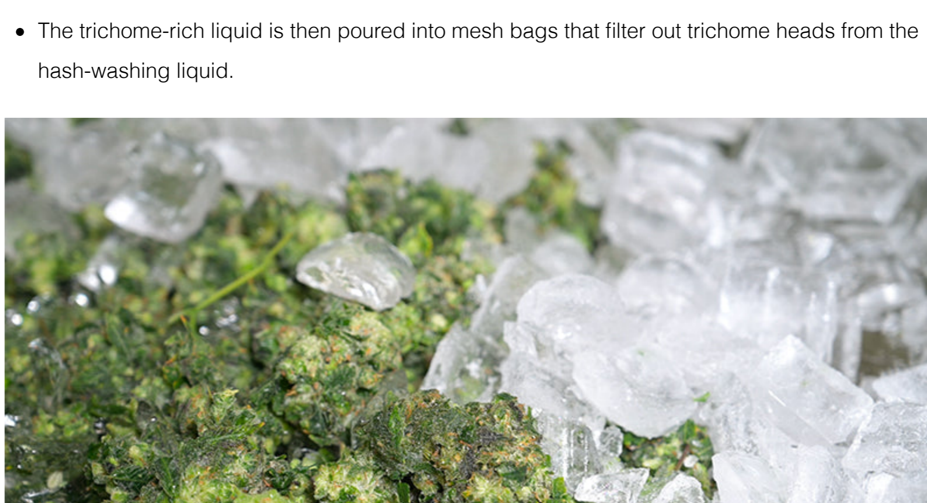
Fresh frozen cannabis being washed with ice and water to mechanically separate the trichomes from the plant material.